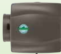
HCWB3-12 Bypass Humidifier 12 gallons per day