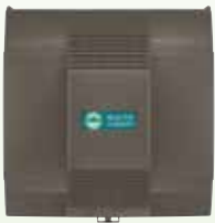
HCWP3-18 Power Humidifier 18 gallons per day

Equipped with a built-in fan, a Power Humidifier circulates humidified air. Since it works independently of your HVAC system, it can deliver humidity even when your system isn't running.