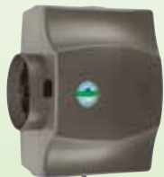
HCWB3-17 Bypass Humidifier 17 gallons per day

Bypass Humidifiers work in conjunction with your HVAC system, using the air handler or furnace fan to direct humidified air throughout the home.