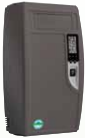
HCSteam-16 Steam Humidifier 16 gallons per day